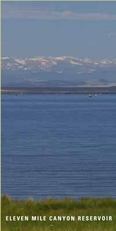
ELEVEN MILE CANYON RESERVOIR