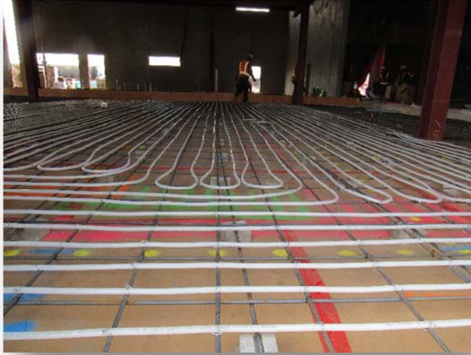
Denver Water Administration Complex, radiant floor heating system in operations buildings. Radiant tubing in the concrete floors uses water from the CUP to heat and cool buildings as the primary HVAC system.