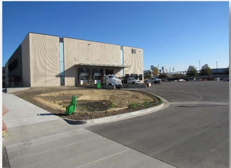
Denver Water Administration Complex, Warehouse

As of Dec. 31, 2017, the actual project expenditures amounted to $95.77 million, or 49 percent of the total project budget.