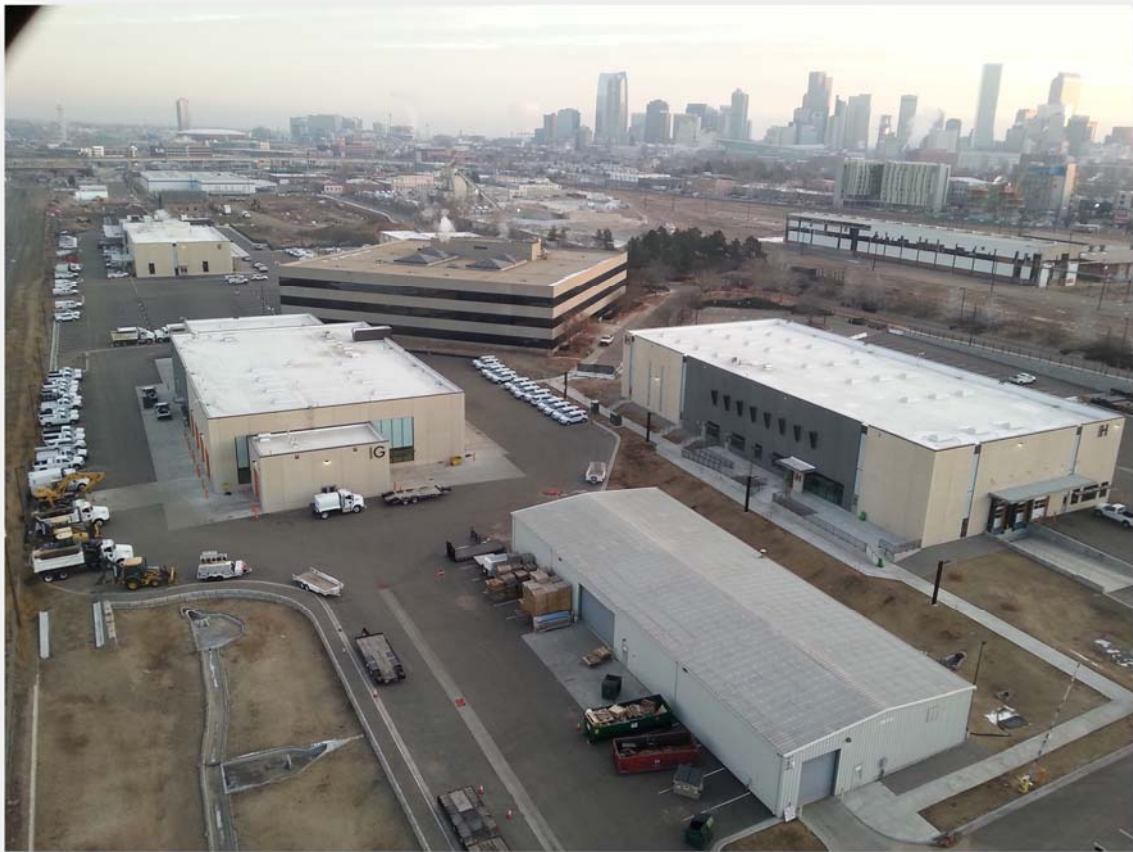
Denver Water Administration Complex, Operations

The first phase of construction began in 2016 with a focus on the operational facilities. To date, the general contractor has completed construction of the Meter Shop, Warehouse, Fleet Services building and Trades Shop. Nearing completion is the landscaping around those buildings, the relocation of an underground conduit and the demolition of old buildings. The second phase, scheduled for summer 2017 through late 2019, focuses on the Administration and Wellness buildings and a parking garage. Construction is expected to be complete in fall 2019. The construction progress can be monitored at: https://www.denverwater.org/project-updates/denver-waters-operation-complex-redevelopment-project